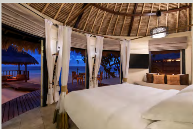
Beachfront Sunset View Pool Villa (110sqm)