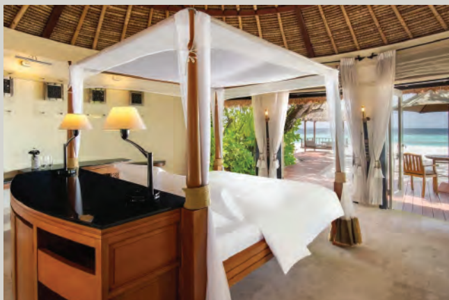
Beachfront Pool Villa (110sqm)