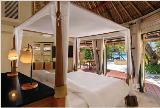
Oceanview Pool Villa (110sqm)