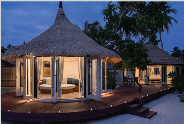
Grand Beachfront Pool Villa (132sqm)