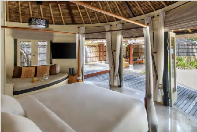
Wellbeing Sanctuary Pool Villa (120sqm)