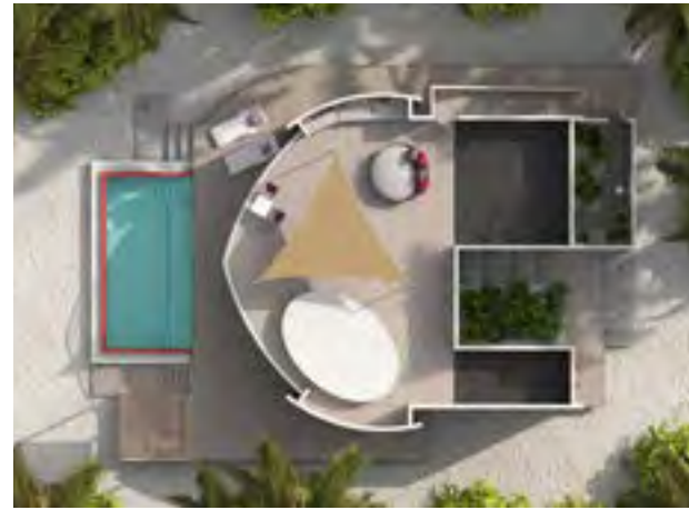
Roof Deck Plan