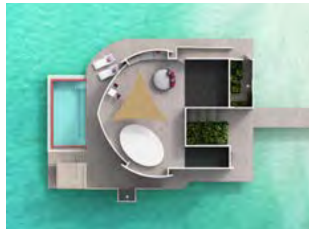
Roof Deck Plan