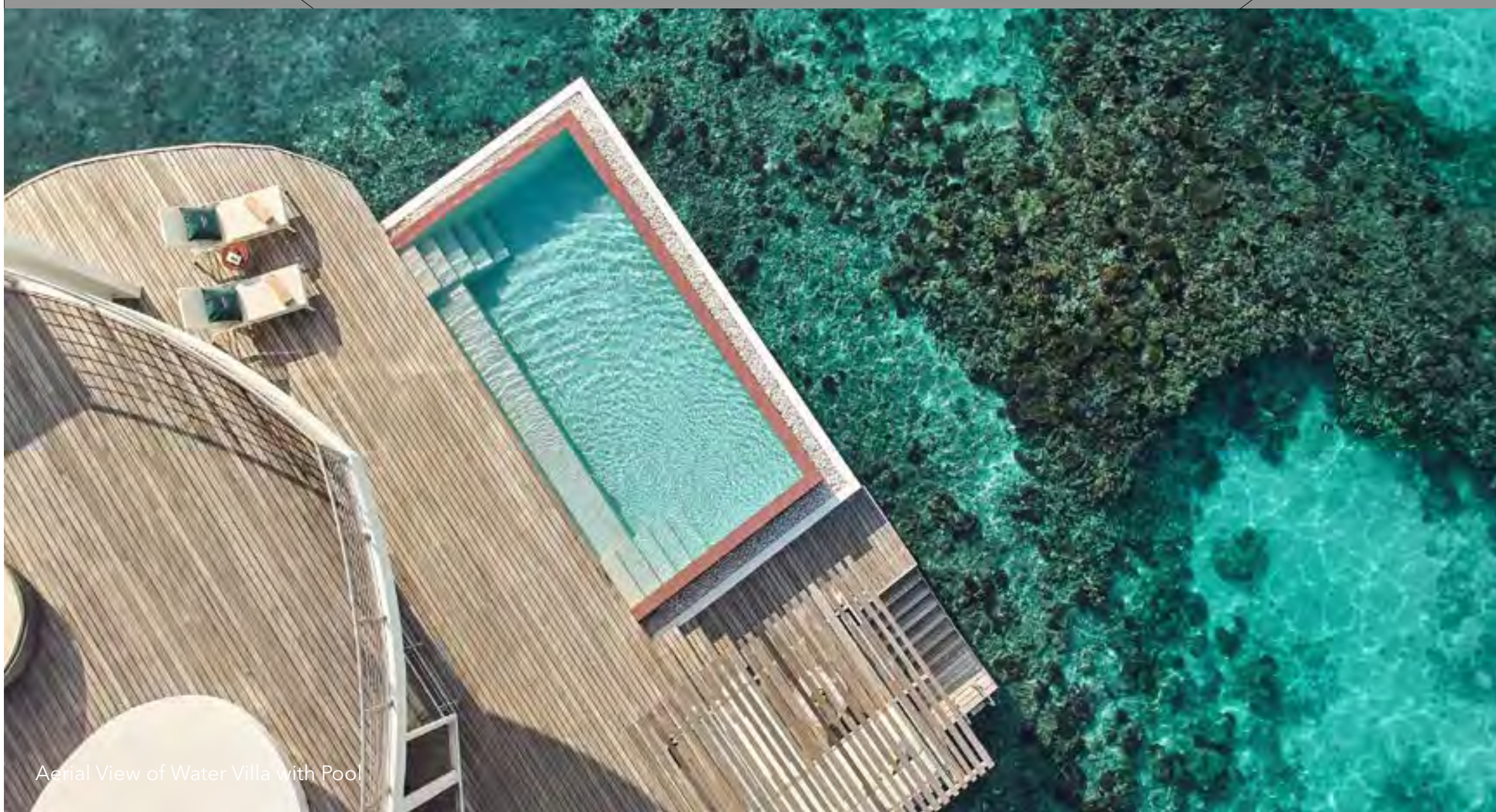
Aerial View of Water Villa with Pool