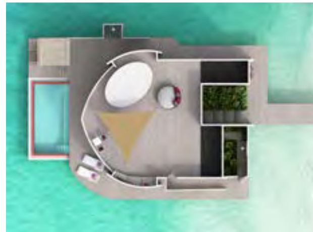
Roof Deck Plan