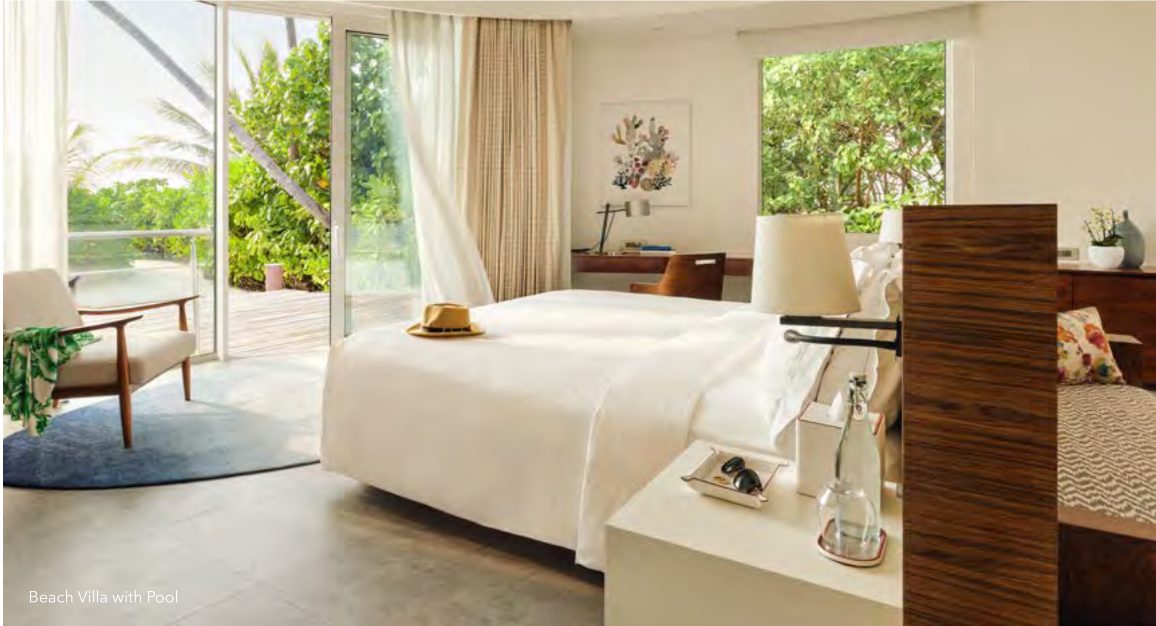
Beach Villa with Pool