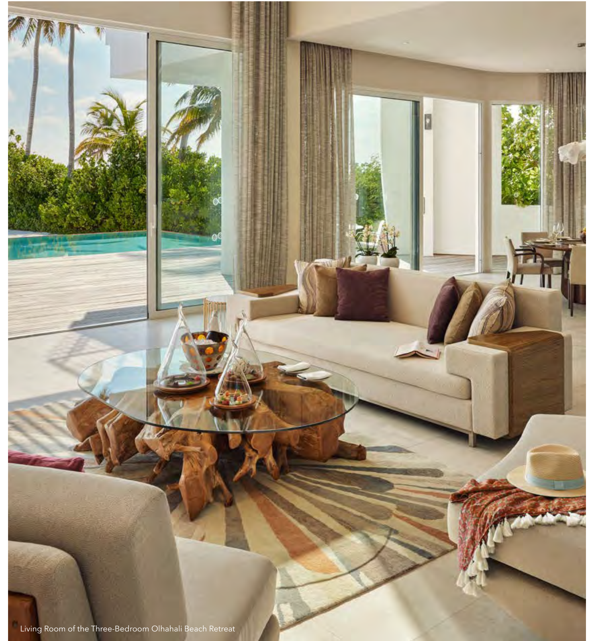
Living Room of the Three-Bedroom Olhahali Beach Retreat

389sqm / overall 997sqm Three-bedroom retreat located over the lagoon featuring dedicated living room, walk-in closets, steam, sauna, private fitness area, possible villa access by yacht thanks to private docking facilities, and a private infinity pool 18*6.3*1.2