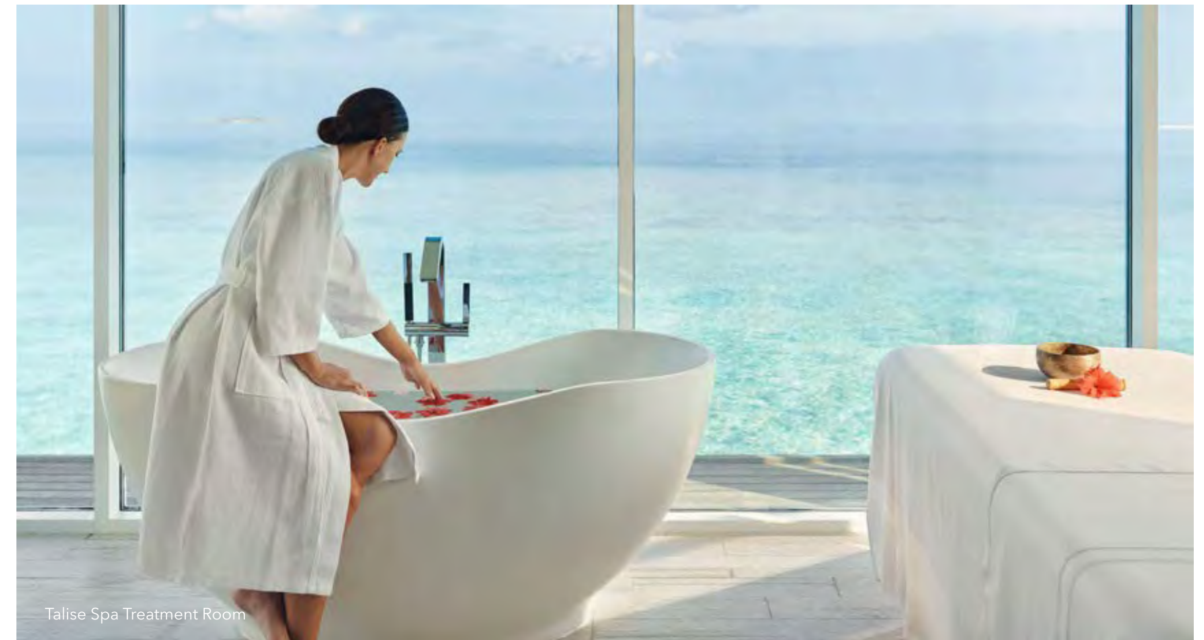
Talise Spa Treatment Room