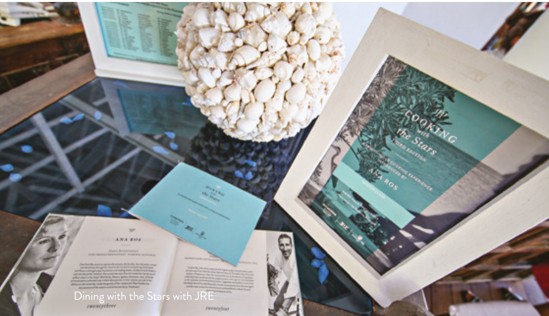
Dining with the Stars with JRE