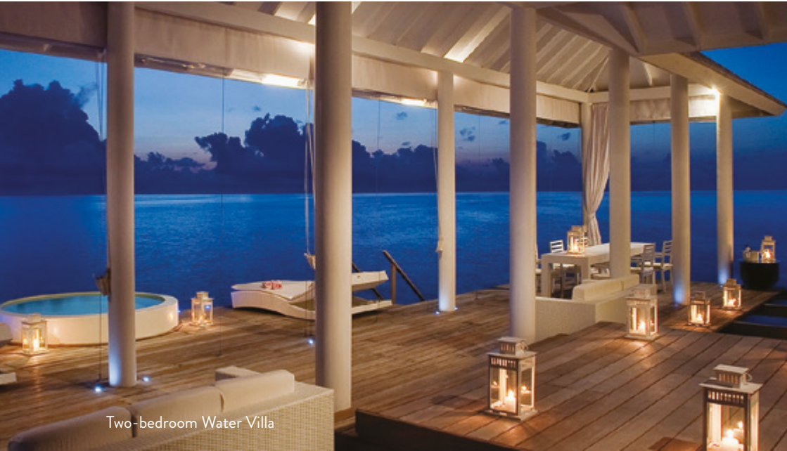
Two-bedroom Water Villa