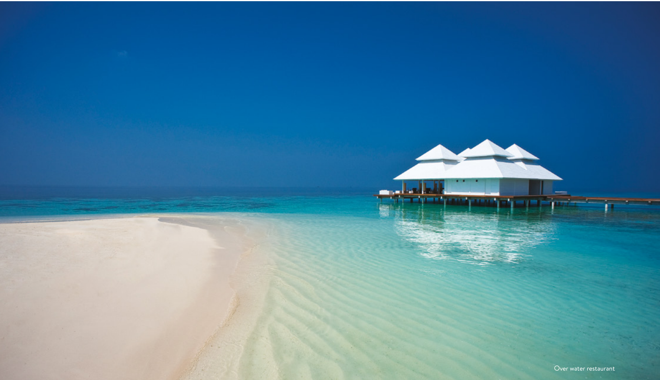
Over water restaurant