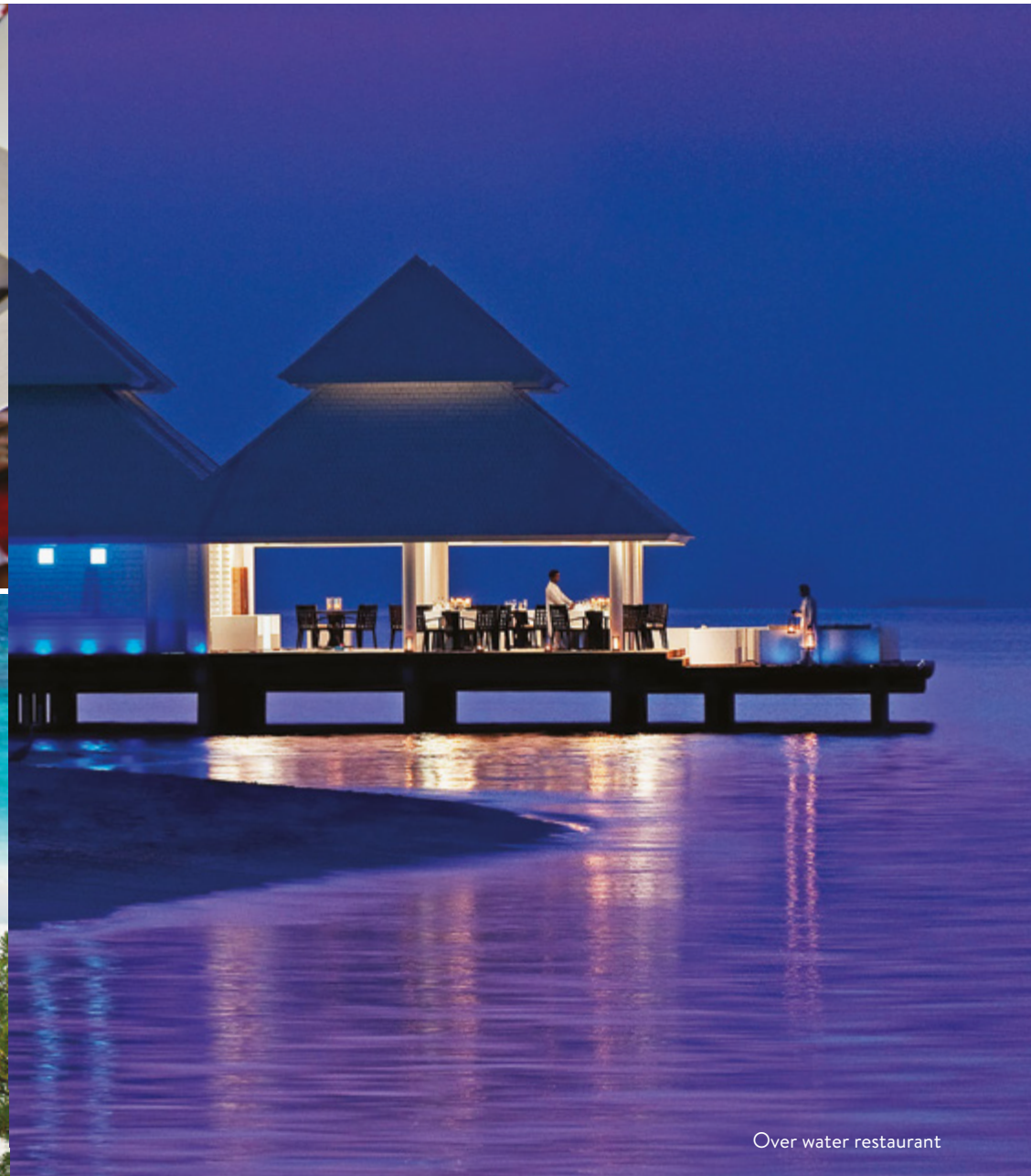
Over water restaurant