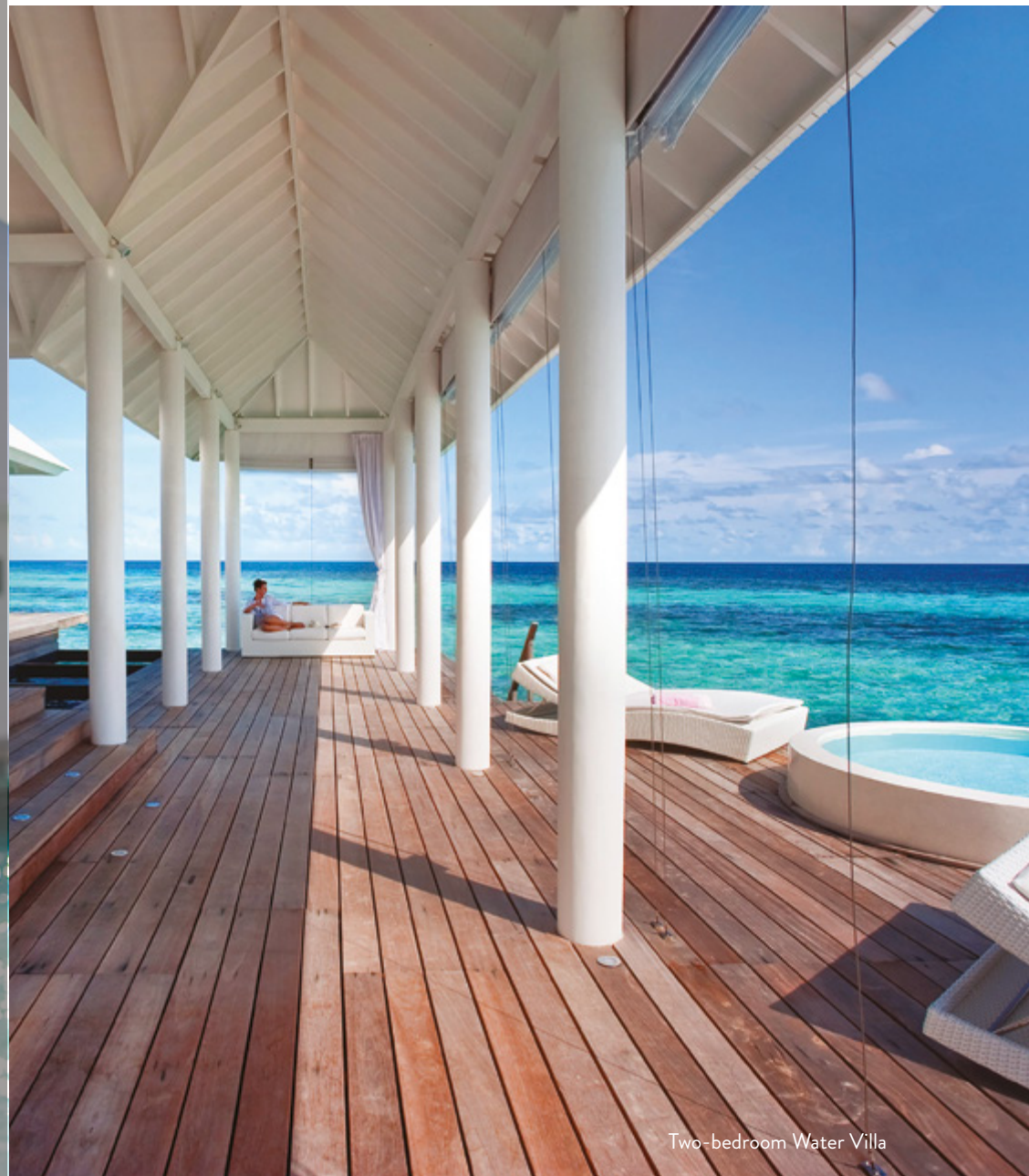
Two-bedroom Water Villa

Diamonds Athuruga features 71 rooms including beach bungalows with open air shower, beach junior suites, water villas built on stilts over the lagoon and two-bedroom over water villas with jacuzzi outdoor pool.