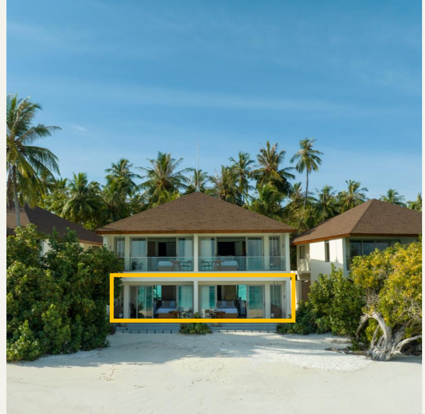
** Room type circled in yellow