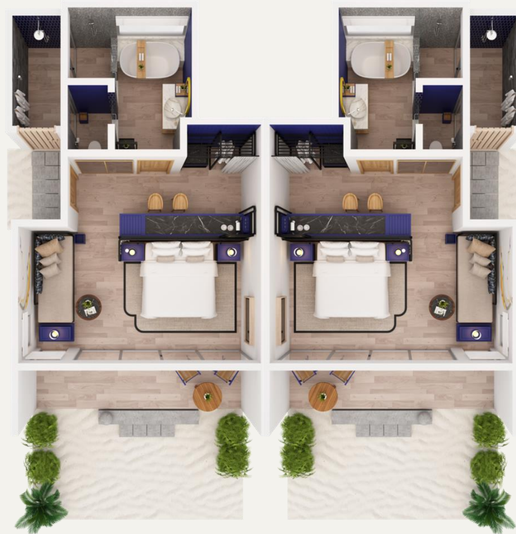
Floor Plan Views