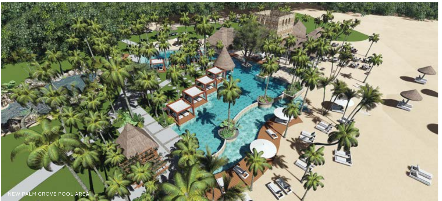
NEW PALM GROVE POOL AREA