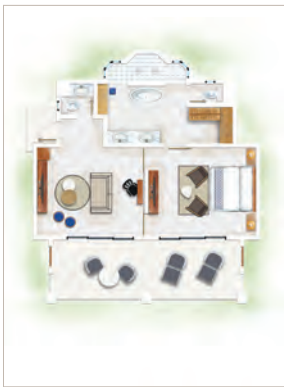
Paradis Suite Beachfront