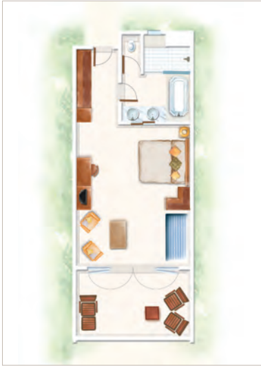
Superior Room First Floor