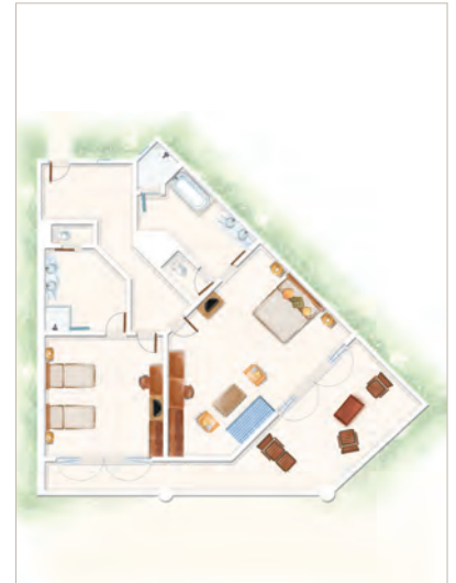
2-Bedroom Family Apartment