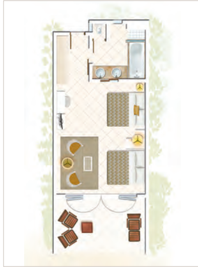
Deluxe Room / Deluxe Ground Floor