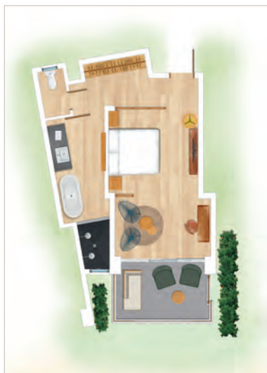
Ocean View Room