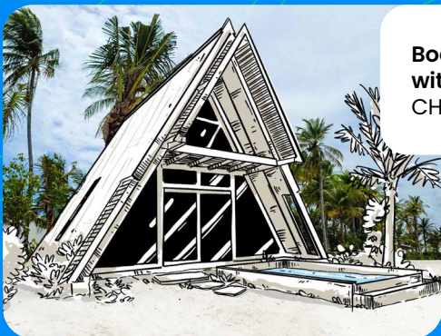
Bodu Haruge Beach Villa with Private Pool CHAPTER 3 Coming soon

Our Haruge Beach Villas with Private Pool feature a modernistic A-frame with angling roofs and a high-ceiling. Past the door, we invite you to dive into one of the most dear stories in the history of Maldives, with brightly colored murals depicting the legend of two lovers — Dhon Hiyala aa'i Alifulhu. Oaga Art Resort's Haruge Beach Villas reimagine their epic story, full of splendor, magic, and wild creatures from the deep blue sea.