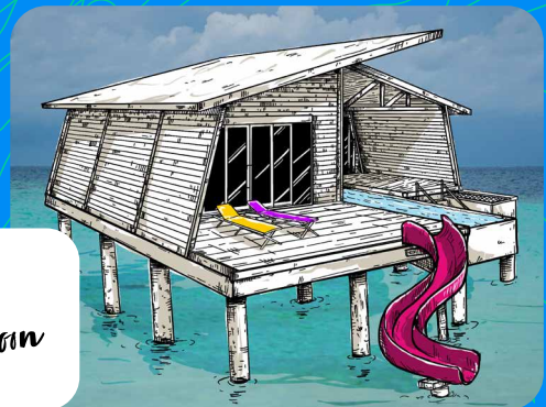
Odi Water Villa with Private Pool CHAPTER 4 Coming soon