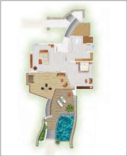
Beachfront Senior Suite with pool