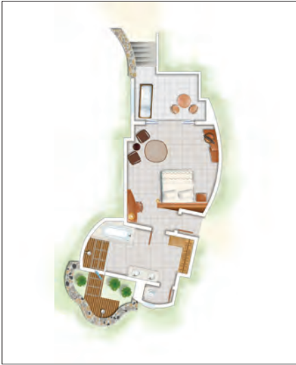
Tropical Junior Suite / Golf Tropical Junior Suite