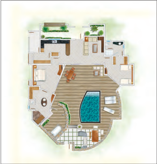
2-Bedroom Pool Villa