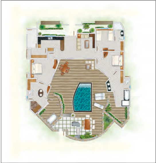
3-Bedroom Pool Villa