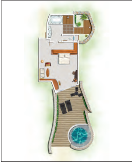
Beachfront Suite with pool