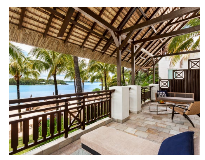
Frangipani One Bedroom Suite - Terrace