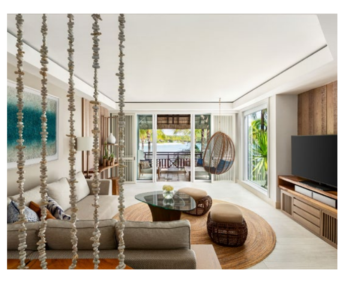
Frangipani One Bedroom Suite - Living Room