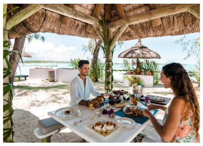
Ilot Mangénie Beach Club