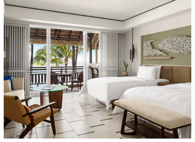
Hibiscus Family Suite Ocean View (two interconnecting suites with one king-size and one twin-size beds)