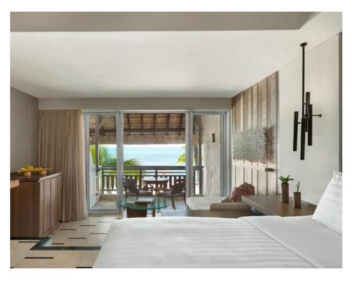
Deluxe Coral Room Ocean View