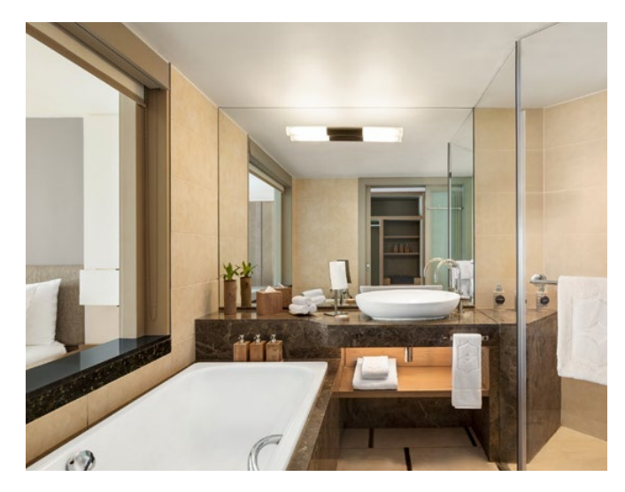
Deluxe Coral Room - Bathroom