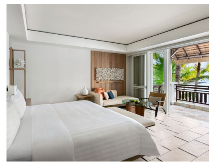
Junior Suite Hibiscus Ocean View