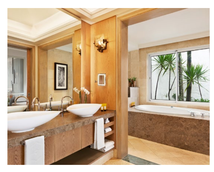
Shangri-La One Bedroom Suite - Bathroom