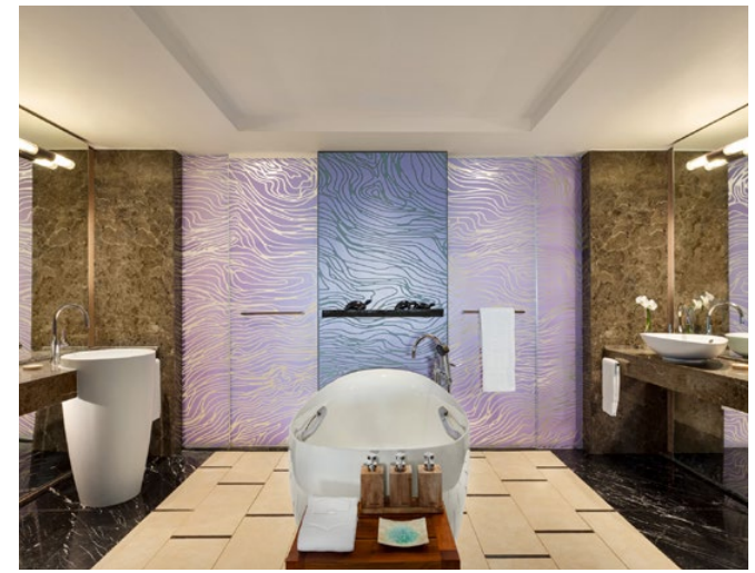
Junior Suite Frangipani Club -Bathroom