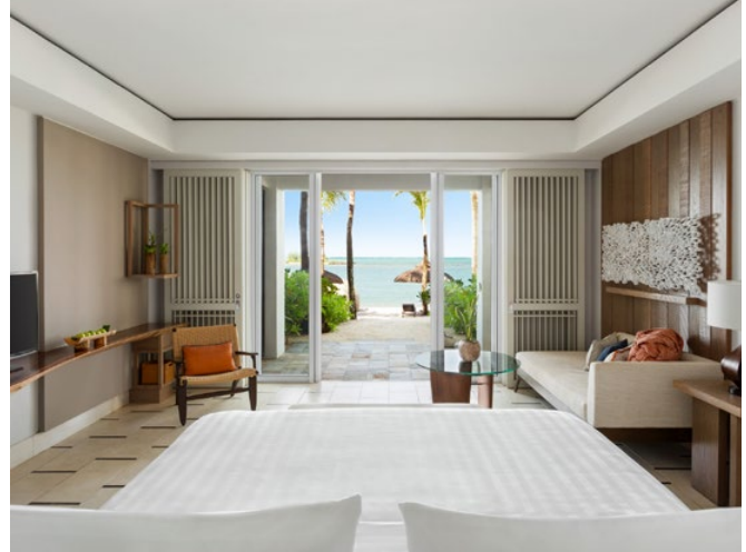
Junior Suite Hibiscus Beach Access