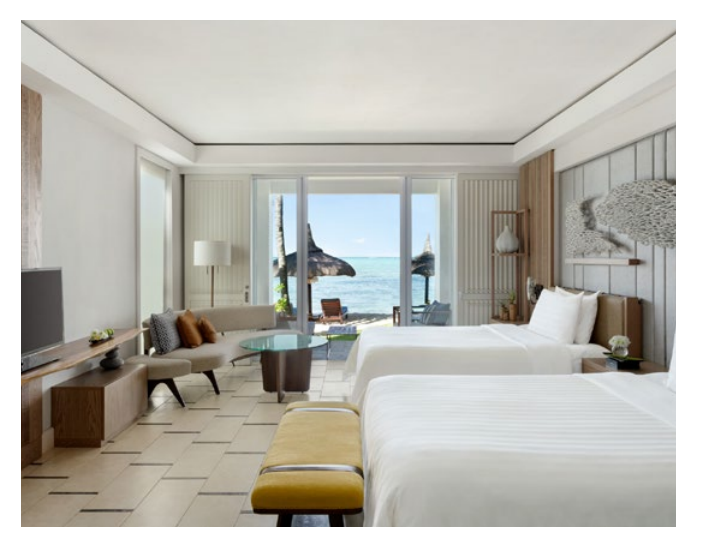
Frangipani Family Club Suite Beach Access (two interconnecting suites with one king-size and one twin-size or king-size beds)