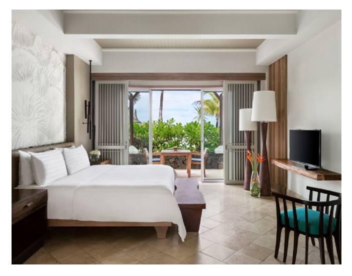
Shangri-La One Bedroom Suite - Bedroom