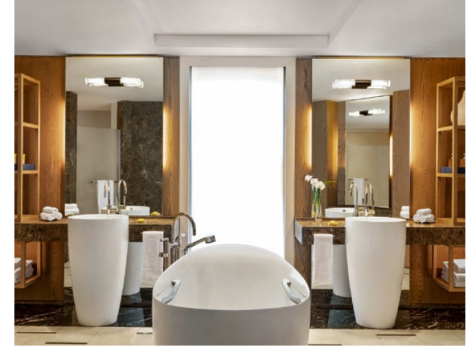
Frangipani One Bedroom Suite -Bathroom