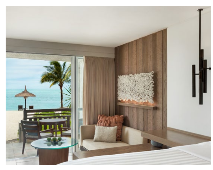
Deluxe Coral Room Beach Access