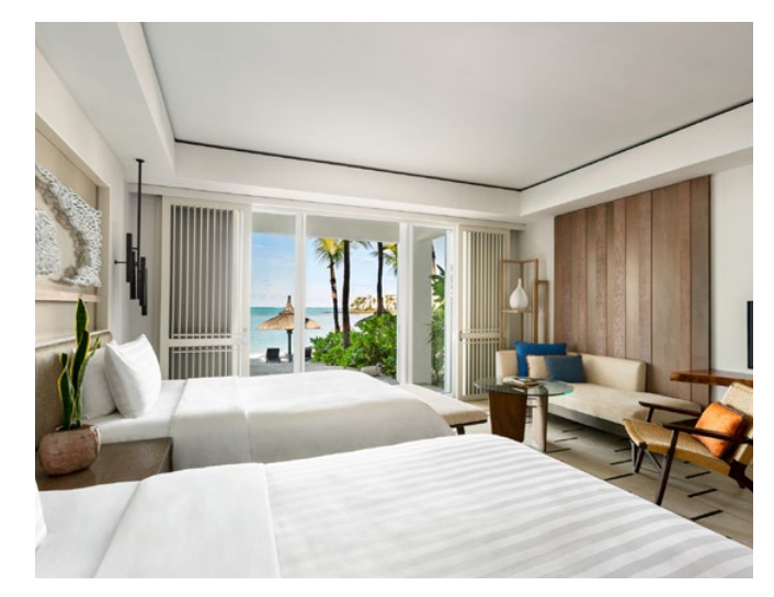
Hibiscus Family Suite Beach Access (1 king size suite and 1 twin size suite)