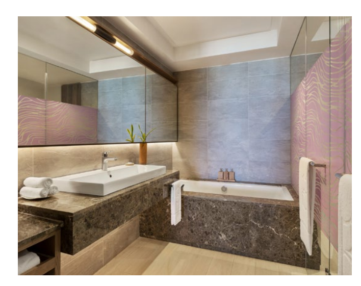
Junior Suite Hibiscus - Bathroom