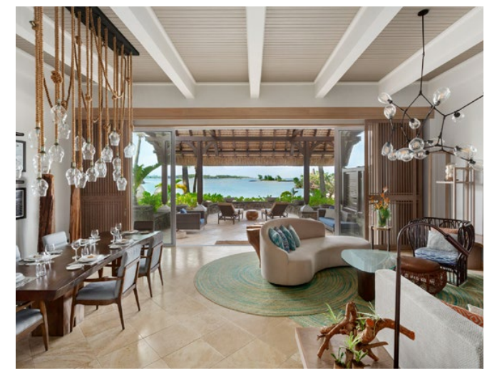
Shangri-La One Bedroom Suite - Living Area