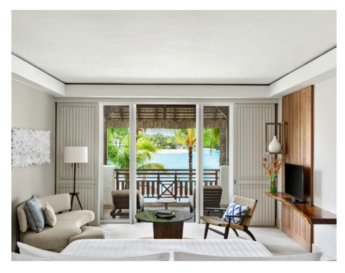
Frangipani One Bedroom Suite -Bedroom