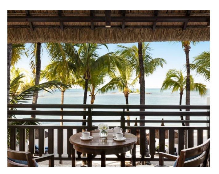
Junior Suite Hibiscus Ocean View - Terrace