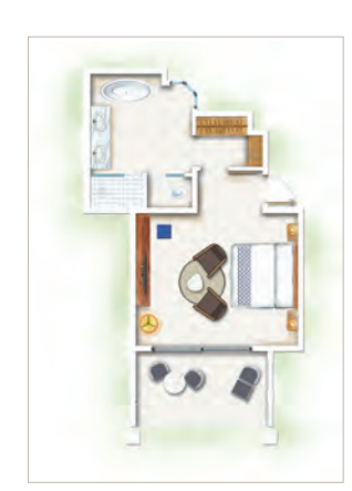
Paradis Beachfront / 2-bedroom Paradis Family Suite Beachfront (interleading)