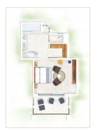
Paradis Bay View