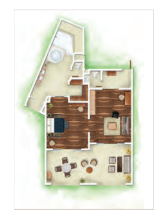
Senior Suite Beachfront