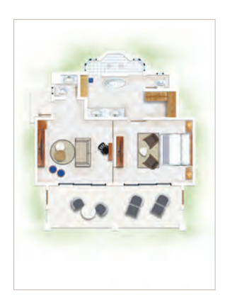
Paradis Suite Beachfront