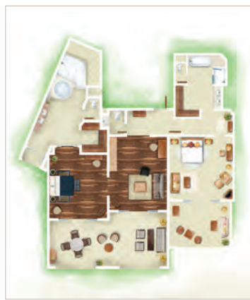
2-bedroom Senior Family Suite Beachfront