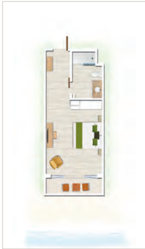
Standard Room / Standard Beachfront