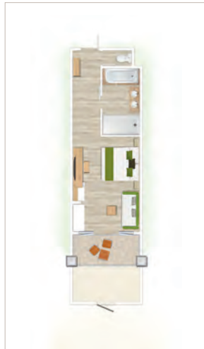
Superior Room / Superior Beachfront