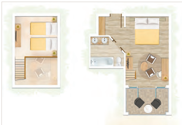
Family Duplex Garden / Family Duplex Sea facing