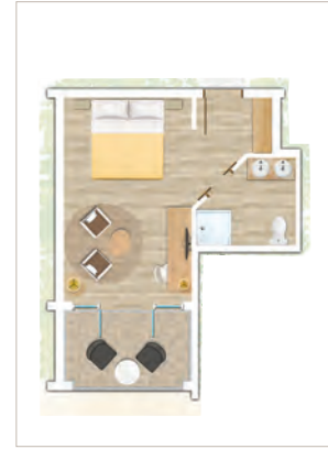
Standard Sea facing