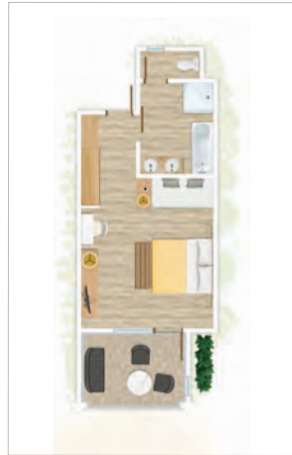
Deluxe Sea Facing Room