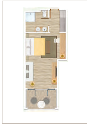
Superior Garden / Superior Sea facing